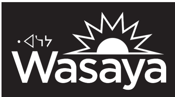
White Application of Primary Brand