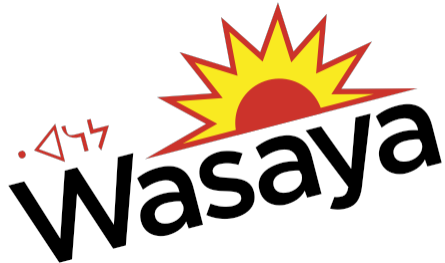
Improper Use of Logo - Angled