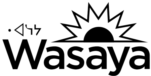
Black Application of Primary Brand